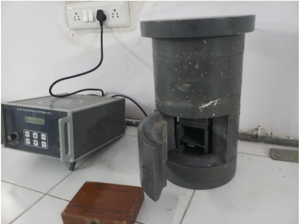
Protection of Radioactivity Radiation

Describe the facilities in the Institution for the management of the following types of degradable and non-degradable waste (within 200 words)