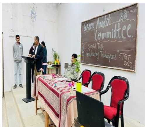
Blessings by Director Sir